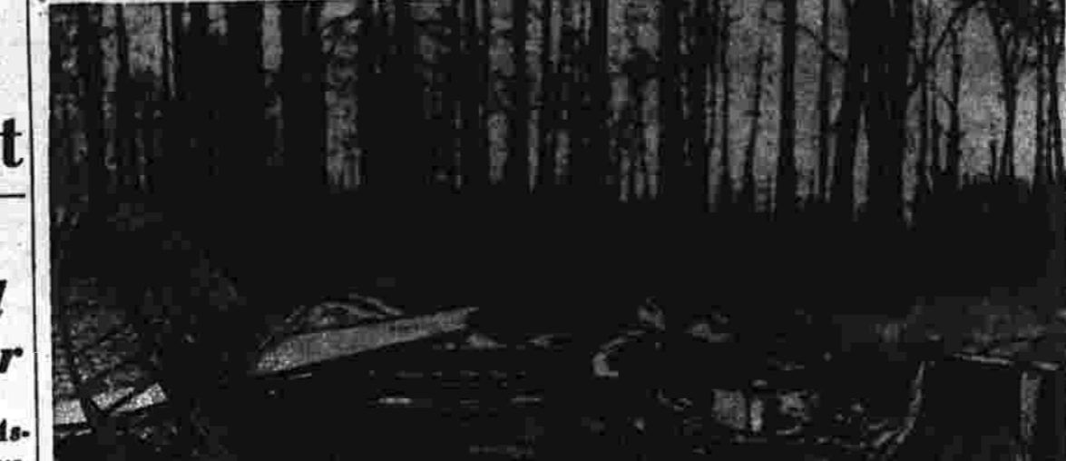
This is the wreck of one of four Army planes that crashed in a snowstorm near Lima, Ohio, at the edge of a woods. The four pilots, all second lieutenants, were killed when the planes plunged to earth and burned within a radius of half a mile, with an flight from Detroit to Louisville, Ky.